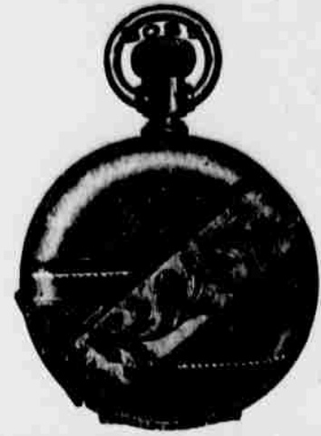
WALTHAM WATCH—VALUE $50.00