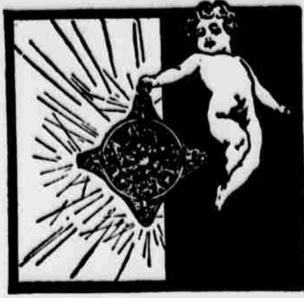
DIAMOND RING—VALUE $100.00

This Ring is offered as the 2nd Prize in The Chief's Big Automobile Contest. It can be seen at the E. H. Newhouse Jewelry Store.