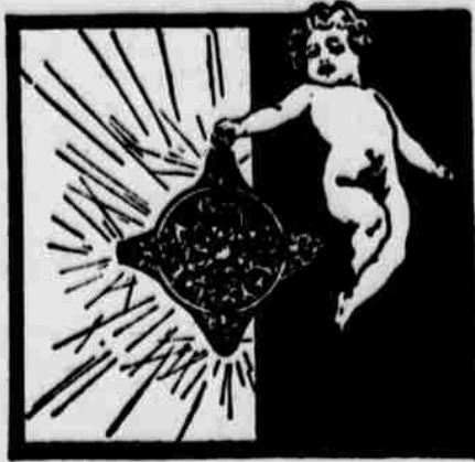
DIAMOND RING—VALUE $100.00

This Ring is offered as the 2nd Prize in The Chief's Big Automobile Contest. It can be seen at the E. H. Newhouse Jewelry Store.