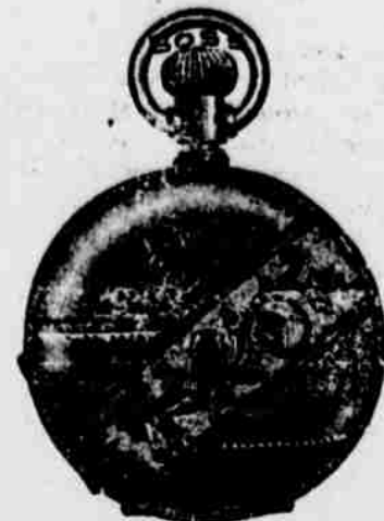
WALTHAM WATCH—VALUE $50.00