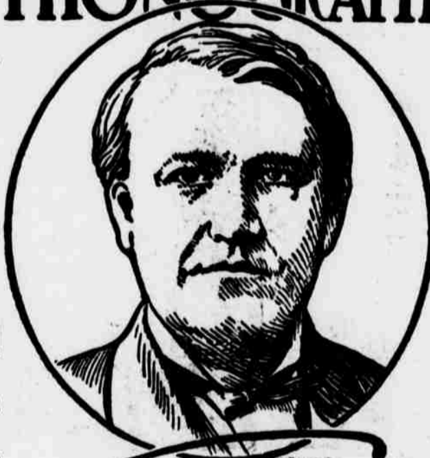
TRADE MARK Thomas A. Edison

At last a Phonograph and Records reproducing with absolute fidelity every little shade and tone of the real instrument.