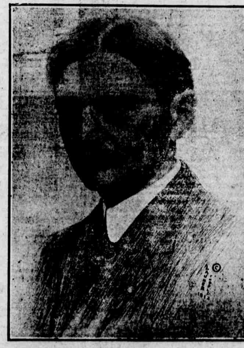
Vice President Elect Thomas R. Marshall