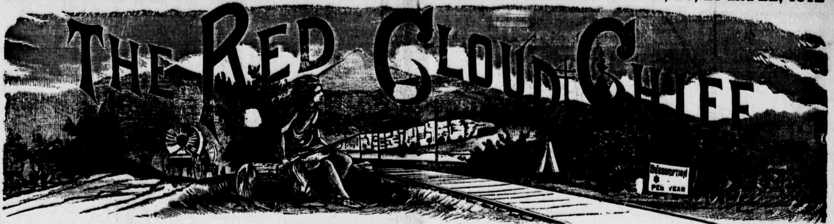
A Newspaper That Gives The News Fifty-two Weeks Each Year For $1.50.