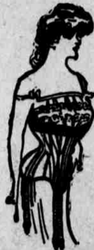
AMERICAN BEAUTY Style 522 Kalamazoo Corset Co., Makon