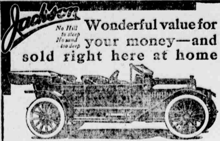
Model "42"—Five-passenger; 40 H. P.; 118-in. wheelbase; full elliptic springs, front and rear; 34 x 4-in. tires. Including complete equipment of top, windshield, gas tank, etc.—$1,500

These are the Jackson cars that have made such a phenomenal success this season—about which you have heard so many good things.