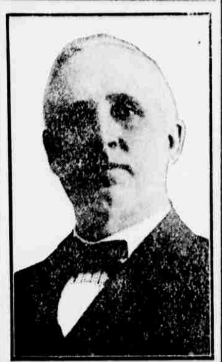
JOHN H. MOOREHEAD Democratic Candidate for the Nomi nation for Governor of Nebraska.