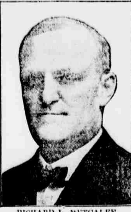
RICHARD L. METCALFE Democratic Candidate For Nomination For Governor of Nebraska Primaries April 19, 1912