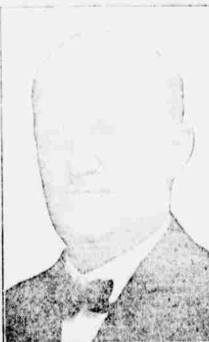
RICHARD L. METCALF Democratic Candidate for Nomination For Governor of Nebraska Primaries April 19, 1912