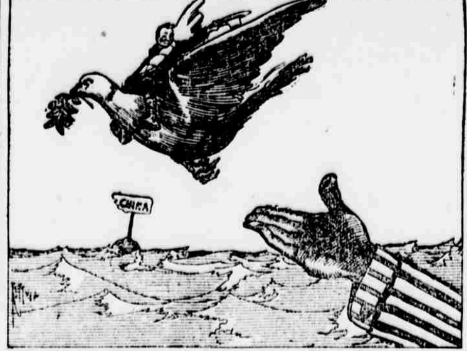
The Fifteenth Regiment Has Been Ordered to China.—News Item. (Copyright, 1912.)