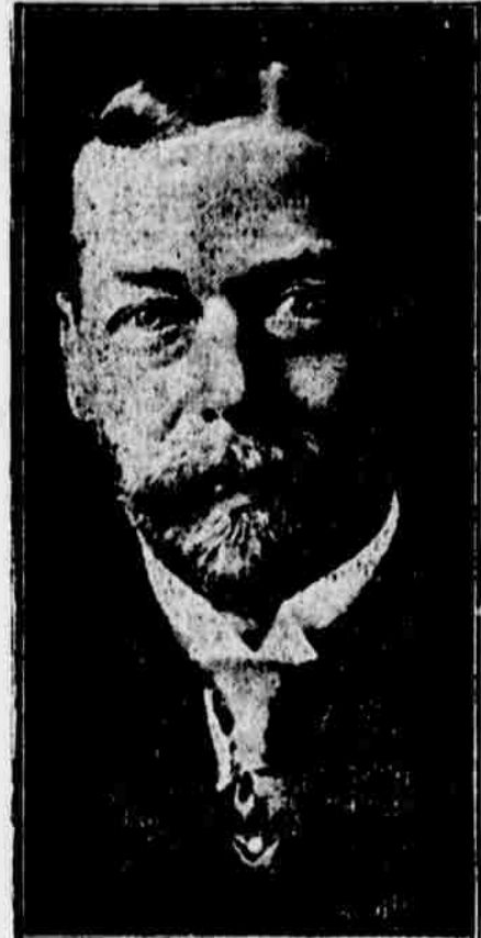
King George V.

Great Throngs in the Streets. From the earliest hours of the morning the population of London and the