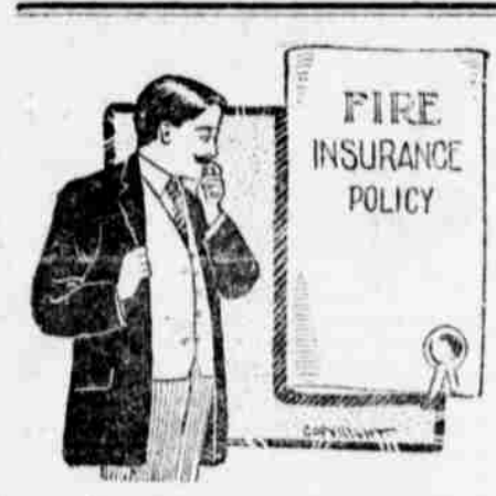
Don't Delay Ordering

a fire insurance policy from us a single day. Fire isn't going to stay away because you are not insured. In fact, it seems to pick out the man foolish enough to be without