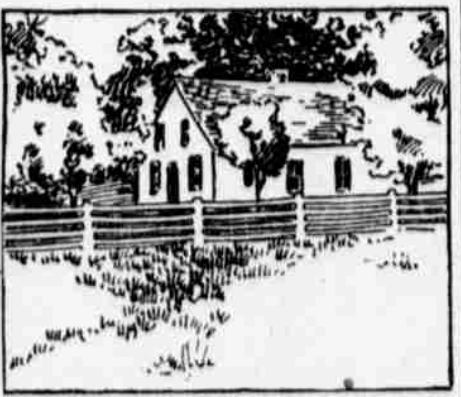
Where Dunkards Worship.

Sharpsburg, Md.-The church shown in the illustration is located one mile from this place, on the famous Antietam battlefield. It was built by the German Baptists in 1853. Some of the most severe fighting of the battle of Antietam occurred near