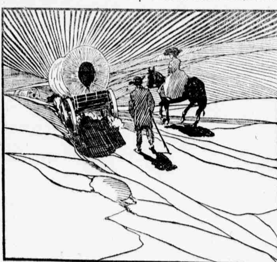
The Trail of Democracy, of America, of the World.

north the power to crush that upris- of government or another, the flag of