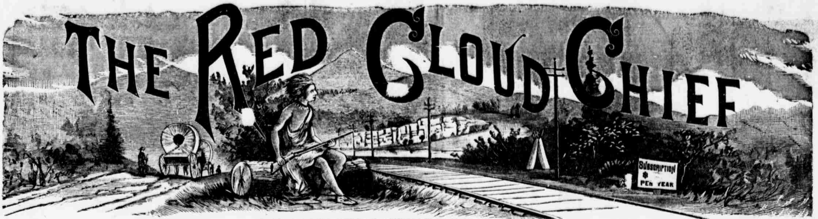
A Newspaper That Gives The News Fifty-two Weeks Each Year For $1.50.