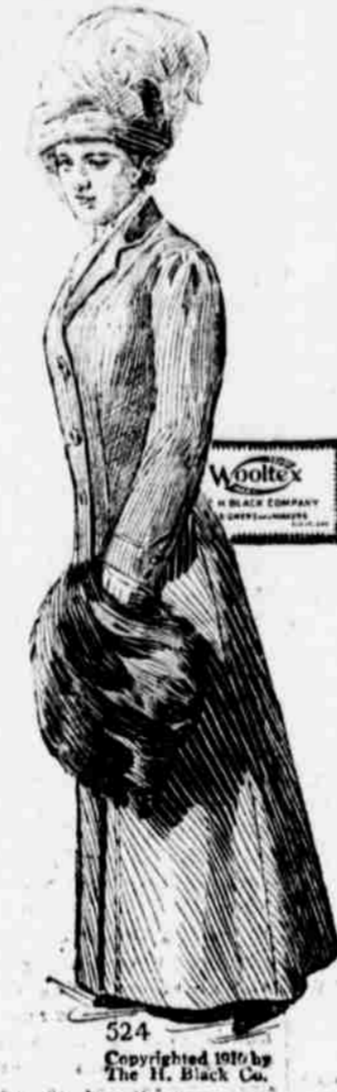
524 Copyright 1910 by The H. Black Co.

We have every opportunity to study and examine the productions of all the leading makers of women's clothing.