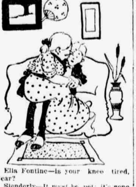
Elia Fontine—Is your knee tired, dear? Slenderly—It must be put, it's gone to sleep.