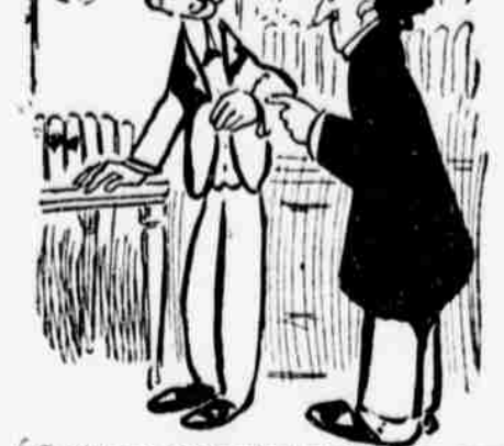
Customer (in book store)—Have you a Chaucer? New Clerk—Never chewed in my life, sir.