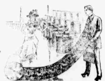
This Department is complete in Carpets, Rugs, Lace Curtains, and Draperies.

At The Opera HOUSE TUESDAY, DECEMBER 28th. Gordinier Bros. present "BIG JIM" or a Heart of Gold. A 4 act rural comedy. Special Scenery Up-to-date Specialties between acts. Guaranteed Satisfaction. 25 35 & 50