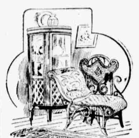
A Model Dining Room We Can fit it for you.

While our Stock is Complete a Word to the wise is Sufficient.