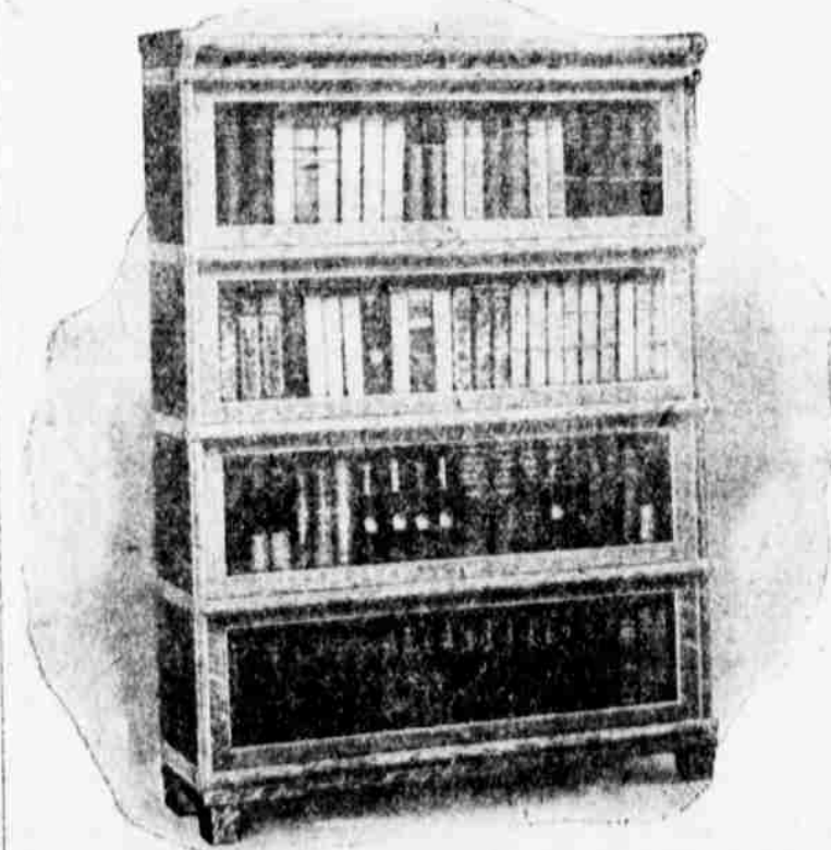
The Celebrated "Globe Wernicke" The World's Best. We are Exclusive agents.