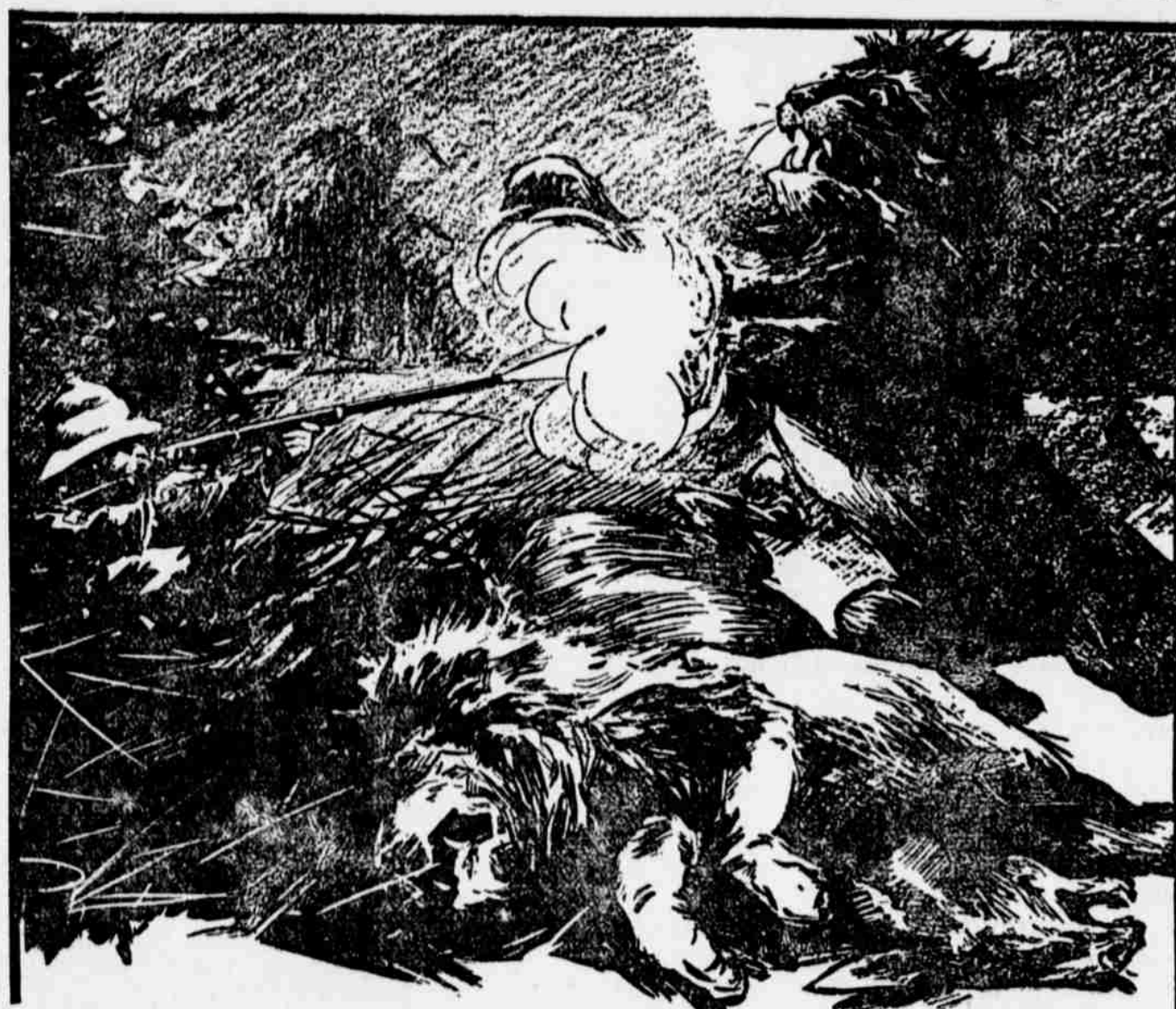
WITH A SAVAGE SNARL HE CHARGED DIRECTLY AT THE THICKEST WHERE I WAS CONCEALED.

The "sleeve dog of China" is the rarest breed of dog in the world. With the head of a pug, he has the under jaw and characteristic "wheel back" of the bulldog, a type to which his body conformation closely approximates. He has the same bowed forelegs, short in proportion to the hind legs, and quarters lightly made in comparison with his broad and massive front. Altogether he is the quaintest and most delightful of toy dogs, but so jealously is he cherished by the royal family of China that it is difficult to obtain a really good specimen.