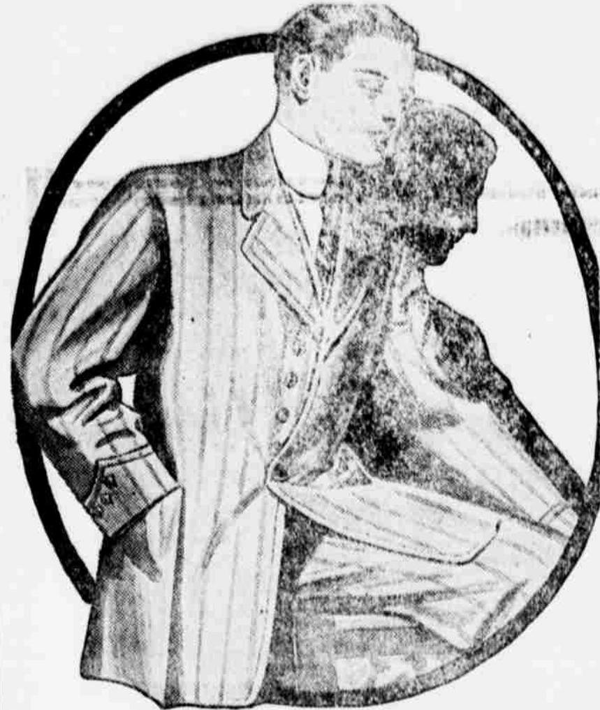
Ederheimer, Sein & Co. MAKERS

We have long pant Suits for Young Men of the Hour. The making of Clothes for these Smart Young Dressers has become an art.