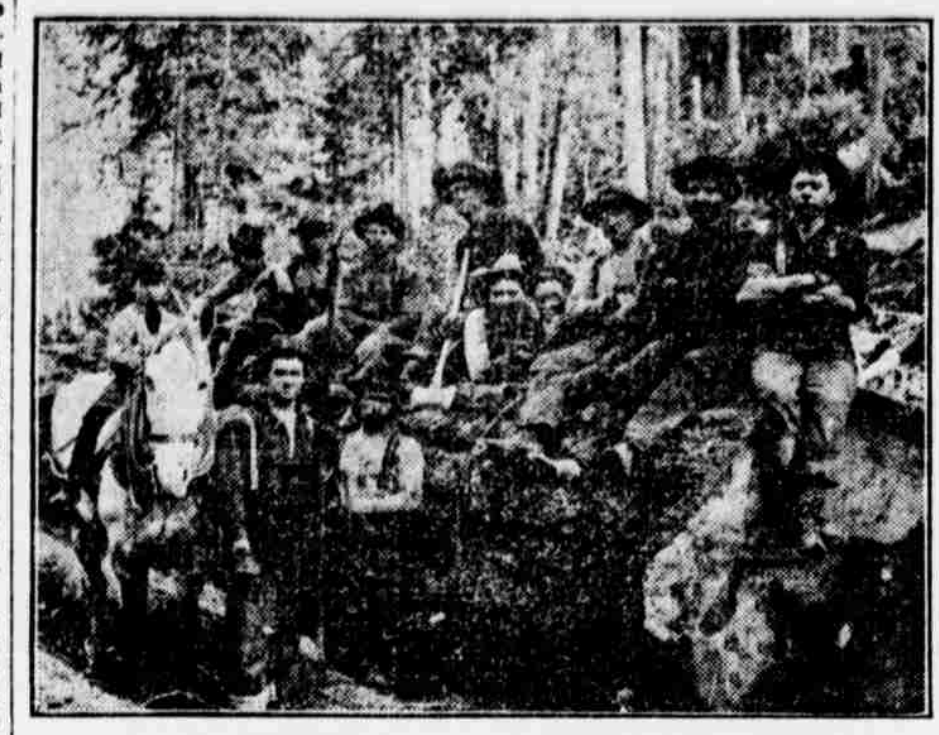
A Scene in the Northern Timber Country.