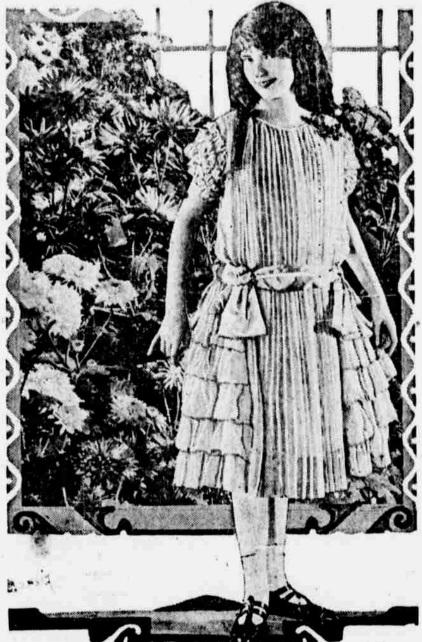
Be-Ruffled and Be-Ribboned

ALL the world loves sweet sixteen in her party frock. There is nothing as important as having "roses in rose-time." That is why mothers love to see little daughter radiant in joyous chiffons and fluffy ruffles. As mother puts the last ribbon in place, subdues a fractious curl, and views with pride this vision of loveliness, the ecstasy of youth returns into her own heart, and she knows not in vain are those exquisite lines. "Backward, turn sapphires, emeralds, amethysts, pearls and rhinestones. Jewels, as hat decoration, is the very latest from Paris. To add to the elegance of millinery fur is abundantly used on hats, large or small. Notice in the center hat to the left of silver cloth and lace that the inevitable touch of fur is present in a bow at the side. Fantastic tams are popular experiments of the small hat, and be it here said that the little snug-fitting hat