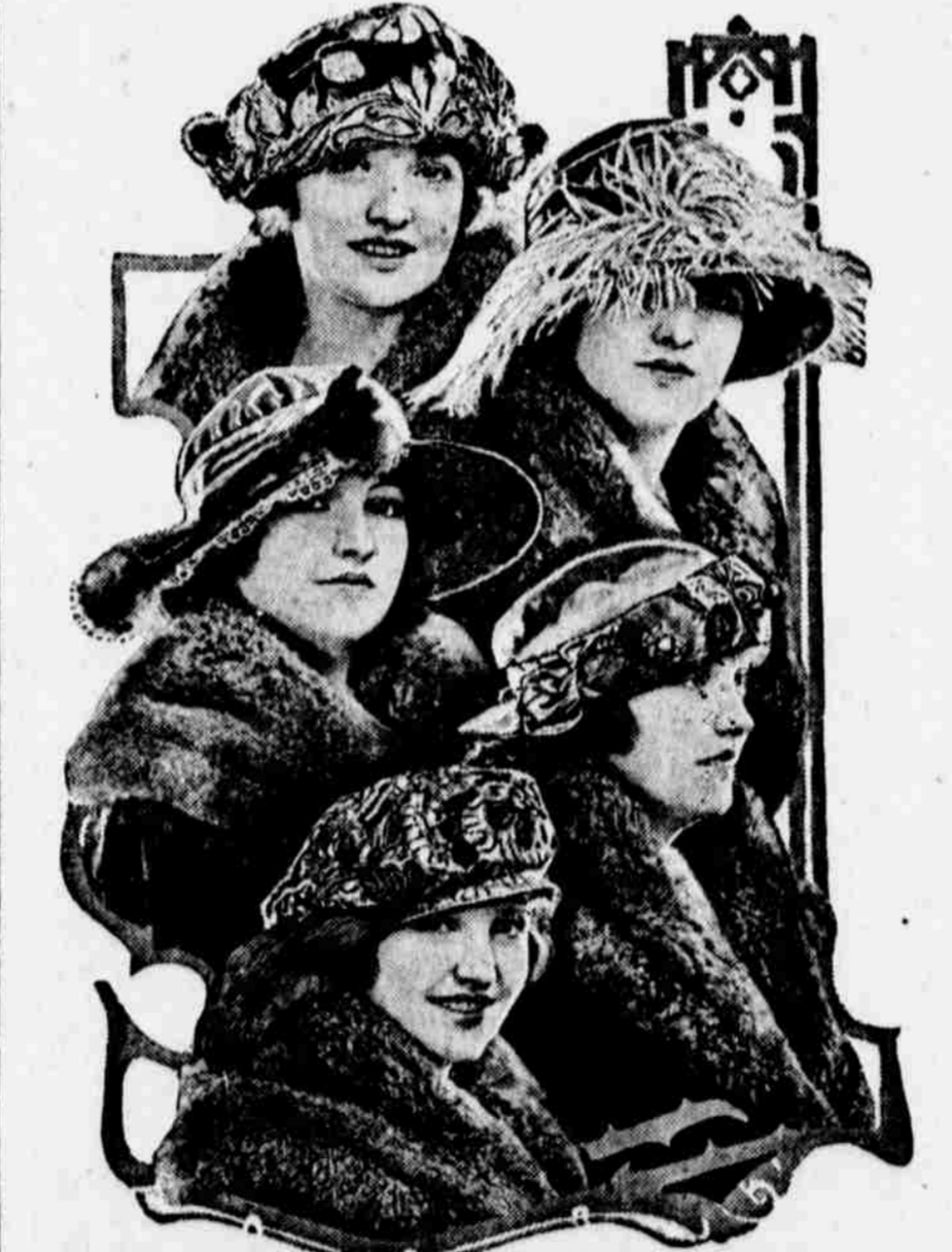
Group of Gorgeous Evening Hats

ionable bouffant effect. Ribbon is charmingly bowed alike at back and front. Changeable taffeta frocks for the junior miss are very popular for holiday parties. If wearing gold, silver and jeweled crowns, signifies royalty, then most of us are queens and princesses this season. Literally and not figuratively, we are crowned in diadems of gold and silver (metal cloth) set with and fancy gold-thread embroidery. Nacre, ombre and changeable are three ways of expressing the new color effects, such as the gray shading to lavender and rose ostrich displays on the silver cloth poke pictured in the group. Julia Bottomley COPYRIGHT BY WESTERN NEBRASKA UNION