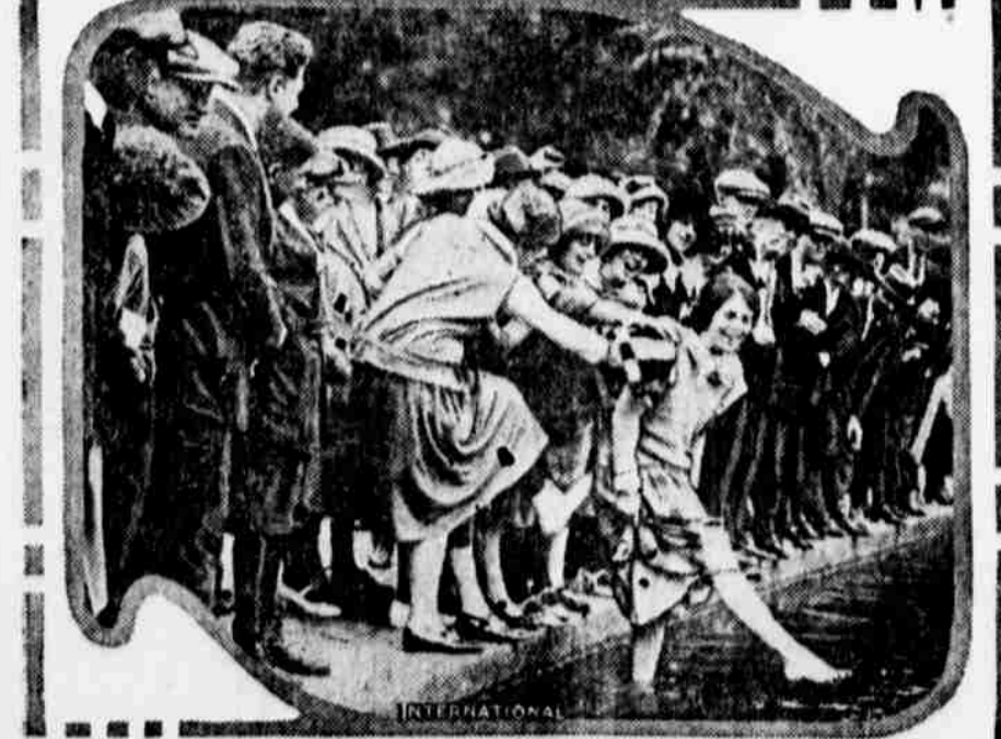
Can you imagine girls going wading in Boston's public frog pond? They did, the other day, but it was a part of the initiation of co-eds of Boston college into sororities, and the candidates peeled off their silken hose and waded into the cold water without a murmur.