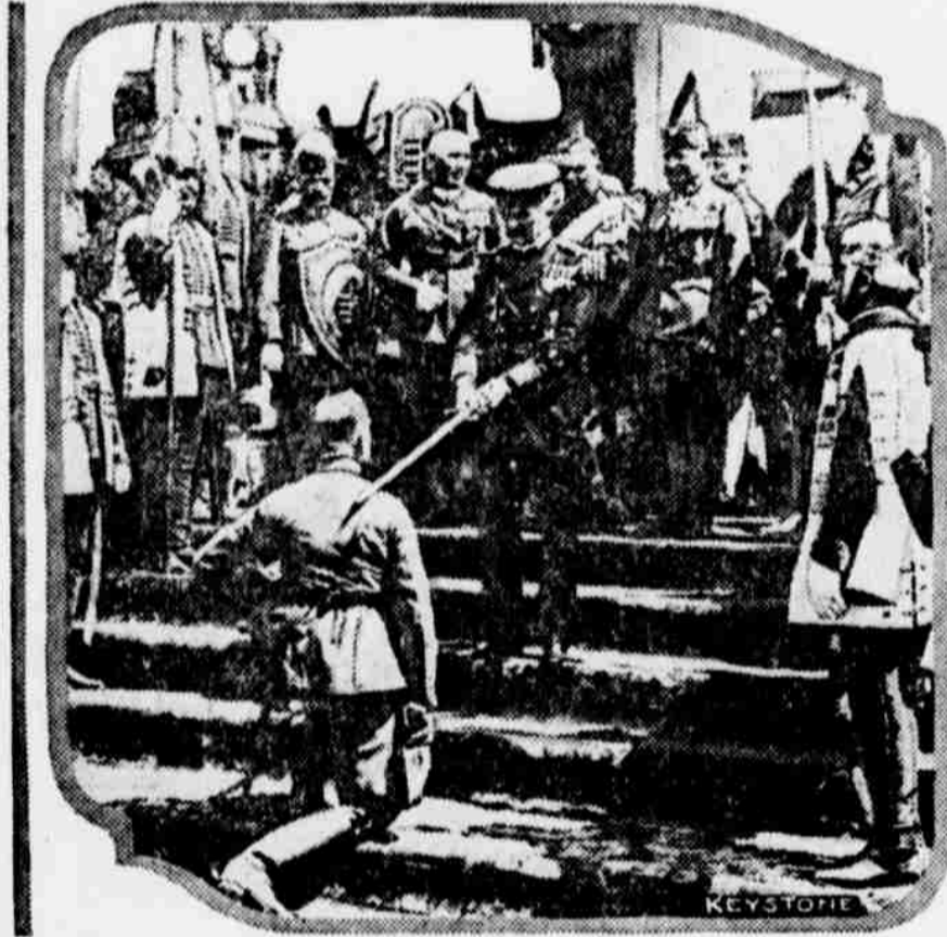
Admiral Horthy, regent of Hungary, rules with all the pomp of a monarch. Appointing officers for the army becomes a regal ceremony with all the trappings of the days gone by. Here the admiral is appointing an officer by tapping him lightly on the shoulder with the flat of his sword.