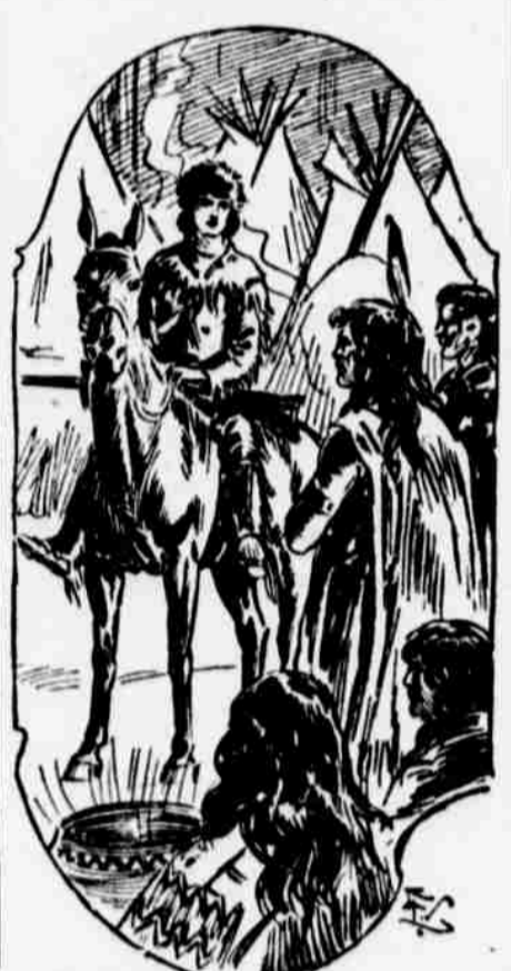
The Squaws Gathered and There Were Grunts of Recognition and Greeting When the Boy Pulled Up in Their Midst.

"Who is that?" "Black Wolf, son of Crooked Lightning."