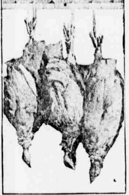
Guineas Are Usually Placed on Market Unplucked.

The marketing season for guinea fowl is during the latter part of summer, and throughout the fall. At this time the demand in the city market is for young birds weighing from one to two pounds each. At about 2 1/2 months old guineas weigh from one to 1 1/2 pounds, and at this size they begin reaching the markets in August. As the season advances the demand is for heavier birds. The usual practice in marketing game birds is to place them on the market unplucked, and in most markets guineas are sold this way. They appear more attractive with feathers on, and sell more readily. Dressed, the small size and dark color of the skin are likely to prejudice the prospective customer who may be unfamiliar with the bird's excellent eating qualities. For hotel and restaurant trade, however, guineas should be dressed in the same way as common fowl. Better ask the dealer, before shipping, whether he wants the feathers on or off.