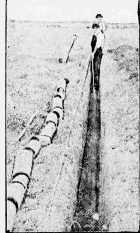
Place Tile as Close Together as Possible for Best Results.

POROUS TILE IS NOT BEST DRAIN Many Farmers Stick to Old-Fashioned Belief That Water Enters Through Walls. POROSITY NOT GOOD QUALITY Little Consideration Should Convince Most Skeptical That Openings Afford Ample Space for Admission of Moisture. (Prepared by the United States Department of Agriculture.) Among the old-fashioned beliefs in connection with the action of tile drains is the one that the water enters not through the open spaces in joints but through the walls of the tile. The fact that drains composed of hard burned or even glazed tile are found to operate as well as the most porous ones has not served completely to dispel this delusion, says the bureau of public roads, United States Department of Agriculture. Occasionally this view is set forth by writers. Tile makers even advertise