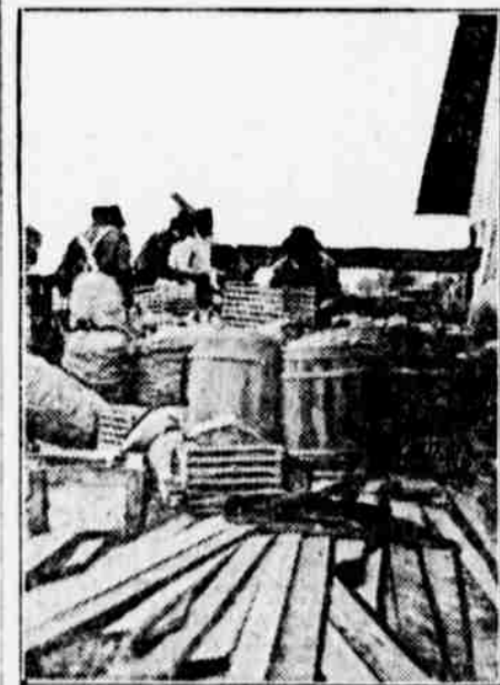
Grading and Packing Potatoes for Market.

Although the potato acreage is estimated by the bureau of markets and crop estimates, United States Department of Agriculture, to be 3,972,000 or 1.6 per cent greater than last year,