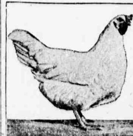
Hens Have Long, Broad Bodies, With Plenty of Room for Reproductive Organs.

The new breed is not yet ready for introduction, and no specimens or eggs will be sold until the characteristics sought have been more firmly fixed. It is as well or better developed than were several of the breeds and varieties when they were introduced by their breeders, but the specialists of the department believe that it is not