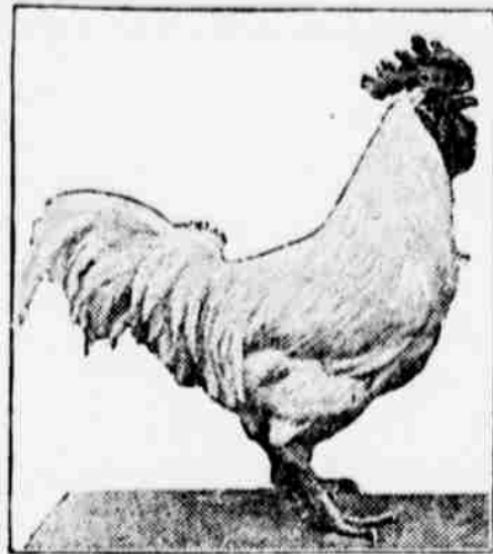
Lamona Males Have Abundant Length and Depth.