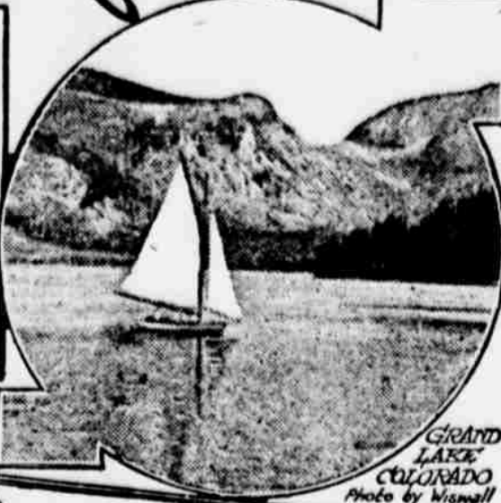
GRAND LAKE COLORADO