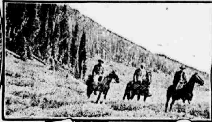
COLORADO CONTINENTAL DIVIDE