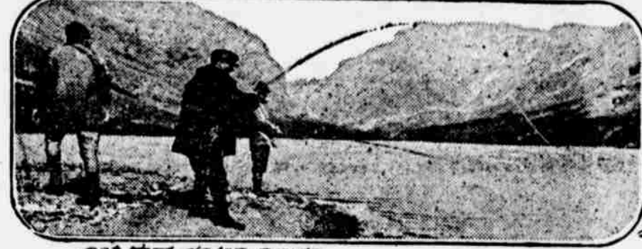
ON THE GRAND RIVER

JOHN DICKINSON SHERMAN. The Colorado river is one of the great rivers of the United States. A joint resolution of congress proposes a "Greater Colorado." This is to be done by adding 423 miles of stream. This addition is to be accomplished by changing to Colorado the name of the Grand river from its source near Rocky Mountain National park in northern Colorado to its junction with the Green river in southeastern Utah. The Grand and Green rivers together make the Colorado river.