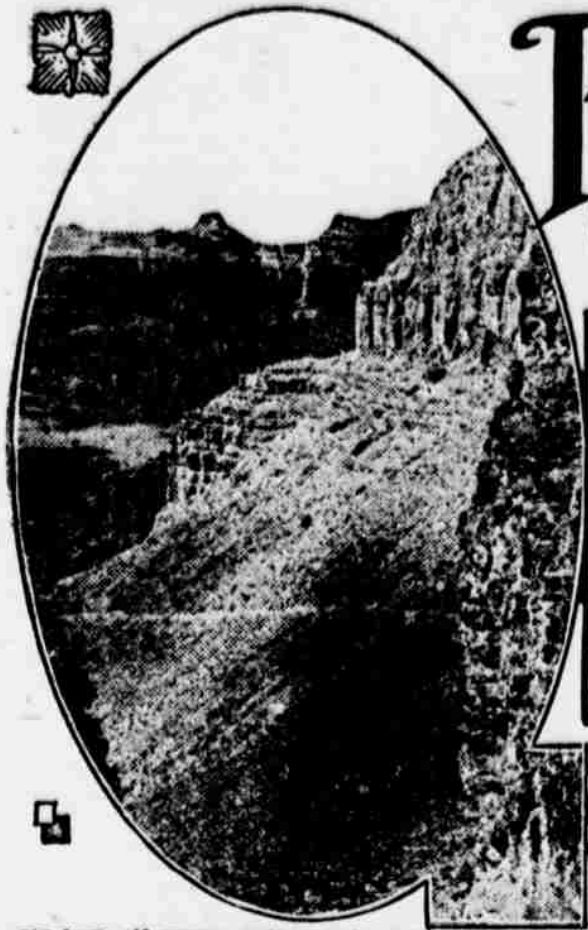
GRAND CANYON NATIONAL PARK