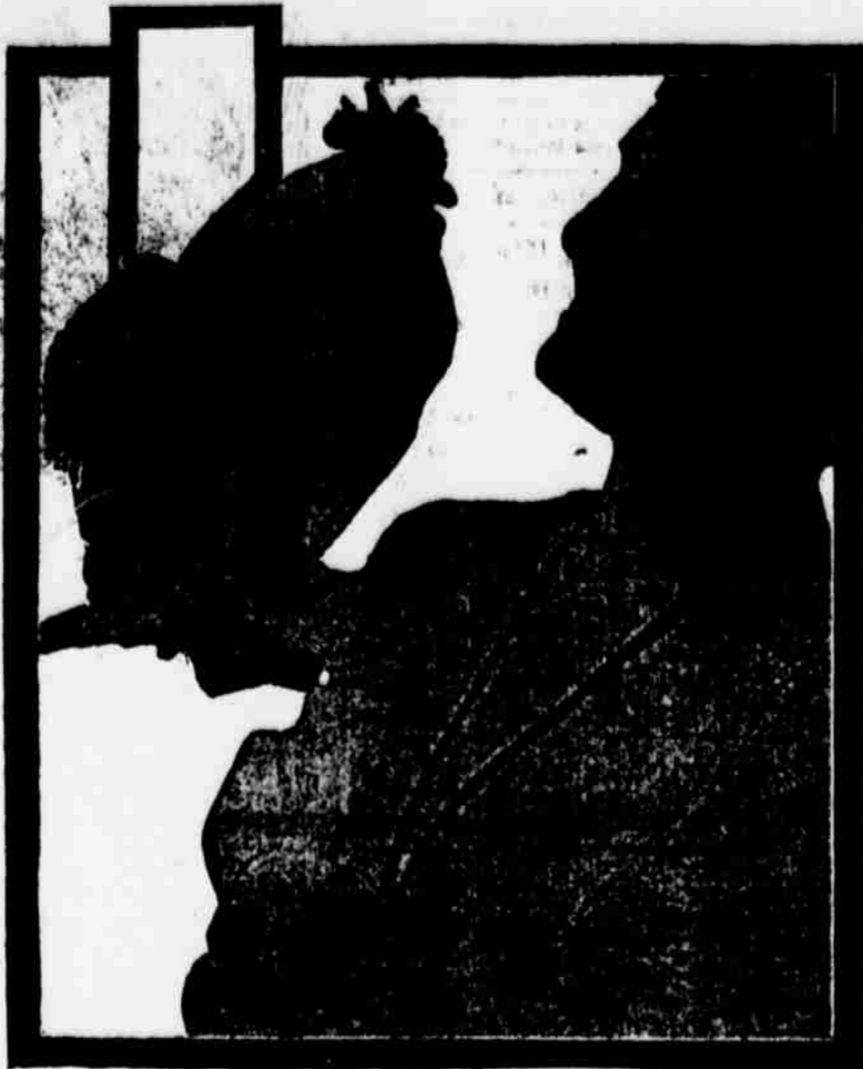
Perched high on the hand of his admiring owner, this rooster doesn't seem to be embarrassed a bit. He is being fitted for the poultry show held in connection with the fair. There is no industry of more interest to all people than poultry. It is one of our biggest businesses. Liberal prizes for poultry are offered by the Nebraska State Fair, Lincoln, Sept. 4 to 9.