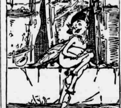
"Not Really Strange."

"Did I understand you to say that?" asked the Ice Tea. "Of course I don't suppose it is so strange as far as my family is concerned, as all my hot tea relatives are around all the time, all the year, and every year."