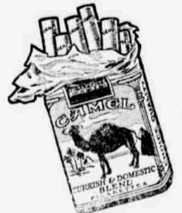
R. J. REYNOLDS Tobacco Co. Winston-Salem, N. C.

Let your own taste be the judge. Try Camels for yourself. A few smooth, refreshing puffs and you'd walk a mile for a Camel, too.