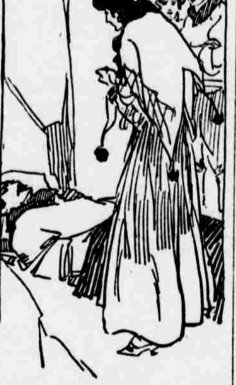
"Now I Go."

She vanished without a sound, gliding through the fringe of bushes and down the steep bank to the protection