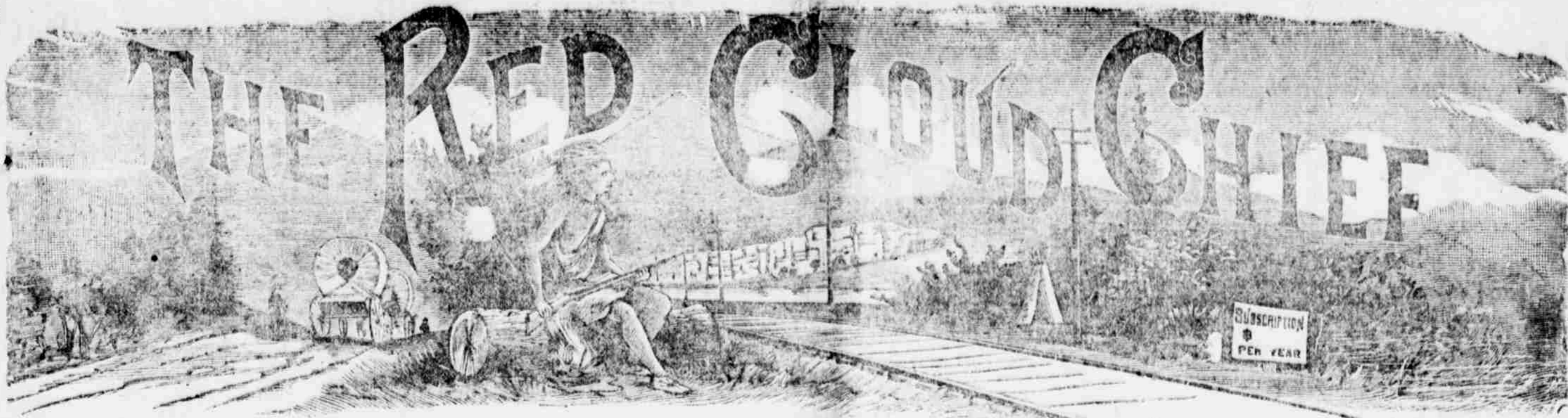
A Newspaper That Gives The News Fifty-two Weeks Each Year For $2.00