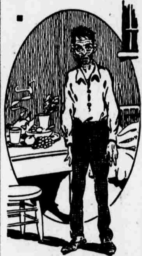
Appetizing Dishes Failed to Tempt Him.

His wife said that he had eaten practically nothing since Thanksgiving, when he partook of the Thank-