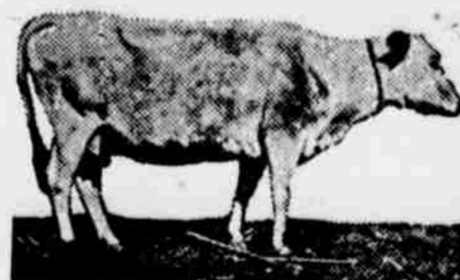
The Sort of Cow Condemned by Dairy Experts.

Eradication of tuberculosis was begun in a thoroughly systematic manner. The regulations of the federal bureau of animal industry and of the state commissioner of agriculture were supplemented by a city ordinance. The city provided at its own expense a large barn, in which were assembled