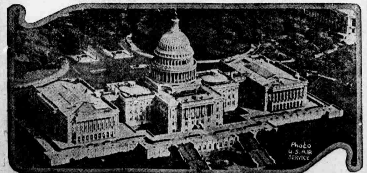
A new and interesting aerial view of the capitol in Washington, made from a United States army plane flying