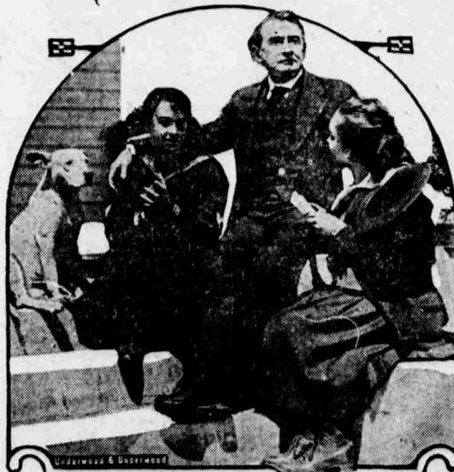
Thomas E. Watson of Georgia and his two granddaughters. Mr. Watson contested the Georgia presidential primaries with Attorney General Mitchell and Senator Hoke Smith, and though he did not get the delegates, he had the largest popular vote.