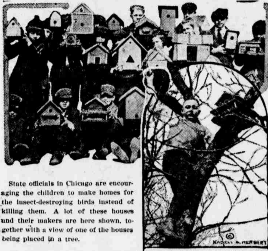
State officials in Chicago are encouraging the children to make homes for the insect-destroying birds instead of killing them. A lot of these houses and their makers are here shown, together with a view of one of the houses being placed in a tree.