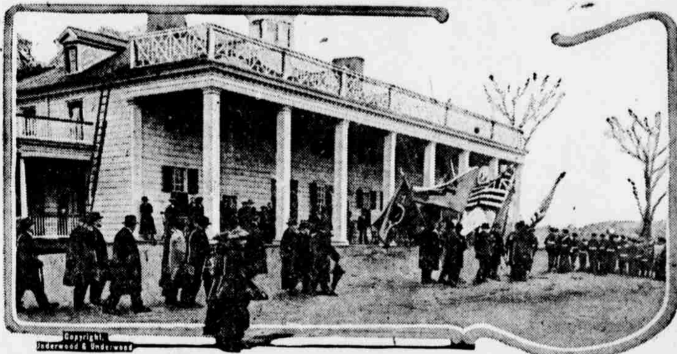
A chief feature of the general convention of the Sons of the Revolution was a patriotic pilgrimage to Mt. Vernon. This photograph shows the members passing in review before the historic mansion.