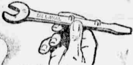
THE ONLY TOOL REQUIRED WITH A NEW DE LAVAL

Such simple construction makes the De Laval not only the longest lasting but also the easiest separator to clean and care for.