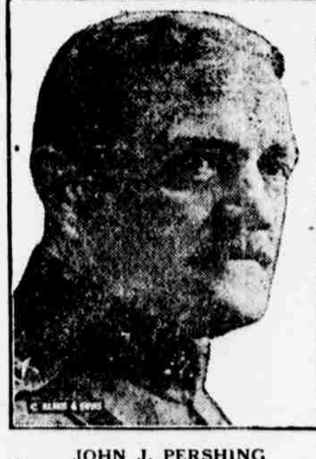
JOHN J. PERSHING for PRESIDENT