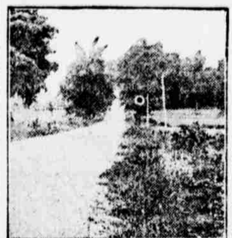
Bituminous Macadam Road.