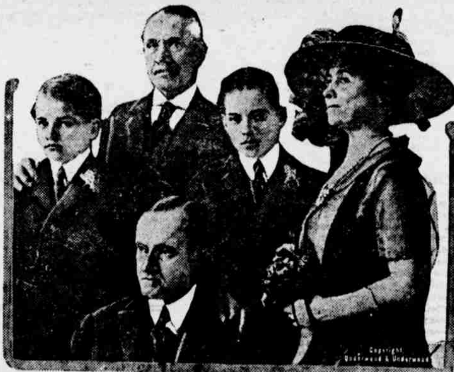
Gov. Calvin Coolidge of Massachusetts with his father, his wife and his two sons.