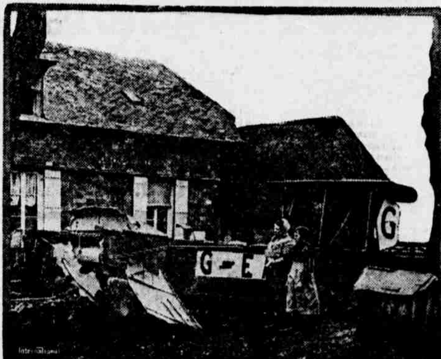
Wreck of the airplane in which Sir John Alcock made his last flight. It stands in front of the Normandy farmhouse near which it crashed, killing the man who made the first non-stop flight across the Atlantic.