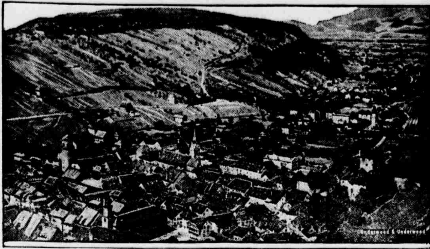
This photograph shows an airplane view of Feldkirch, the capital of the province of Vorarlberg, Austria, which is to be ceded to Switzerland.