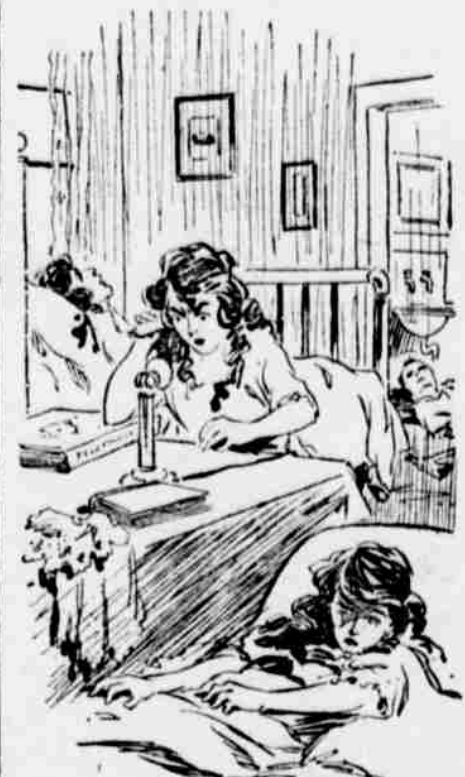
"Please, Come to Our House Quick!"