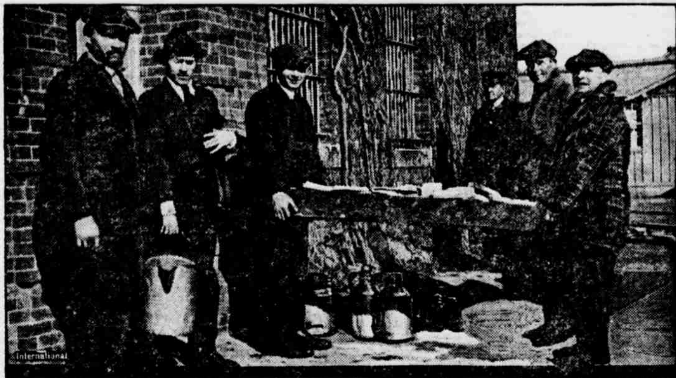
Reds arrested in the late raids in Massachusetts are enjoying Uncle Sam's hospitality at Deer Island, Boston, while awaiting investigation or deportation. While there they are made to aid in the care and feeding of their anarchistic brethren. The photograph shows group of arrested radicals bringing food into one of the detention buildings on the island.