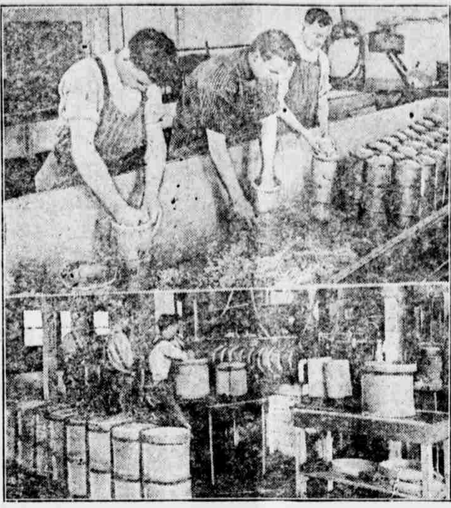
Above-Putting Curd in Hoops for Pressing. These Hoops Are for a Size of Cheese Known as "Young America." Below-Paraffining and Boxing Cheeses.

threpared by the United States Depart- | principally American Cheddar, al-