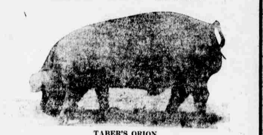
TABER'S ORION TABER'S ORION, By The King PRICE SENSATION, By King Sensation

44 Head of Tried Sows, Fall and Spring Gilts, and Nine Boars THURSDAY, JANUARY 8, '19