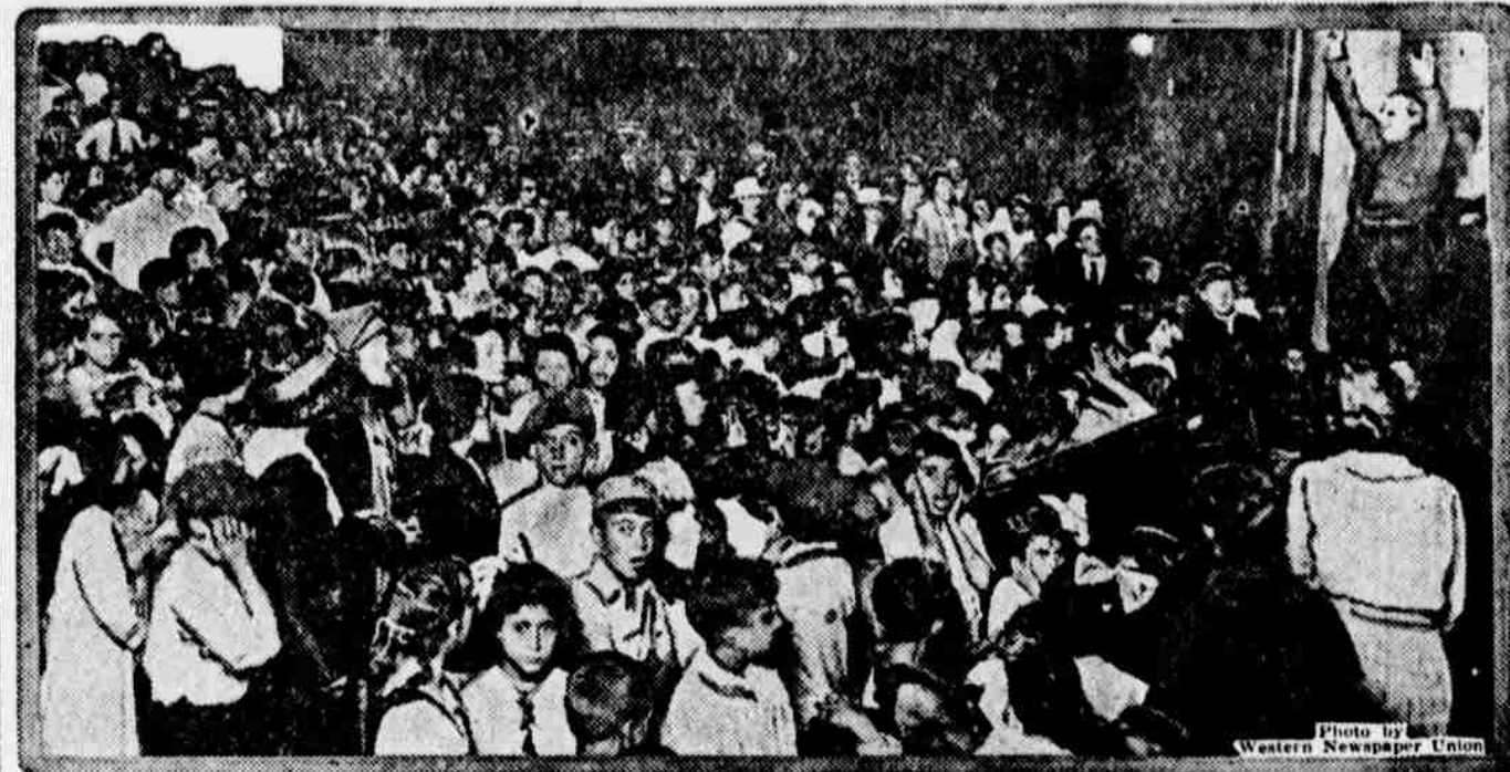
A novel idea in Americanization methods, sponsored by some of the leading figures in the American music world, is that of teaching aliens the love of their adopted country by means of proper music. At Greenwich house, 44 Barrow street, New York city, no less than fifteen different nationalities sing in a "melting pot," where the good music of the Land of the Free brings clean thoughts and undermines the "red" and radical propaganda that the enemies of organized government try to force into the minds of our coming generation.