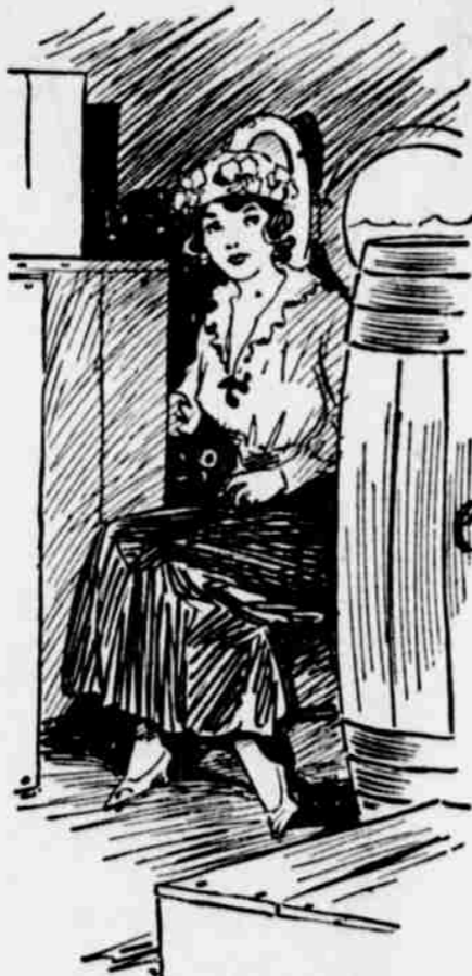
Hid in a Nook Until the Vessel Was Out of Sight of Land.

Becoming convinced that it was impossible to obtain a passage before