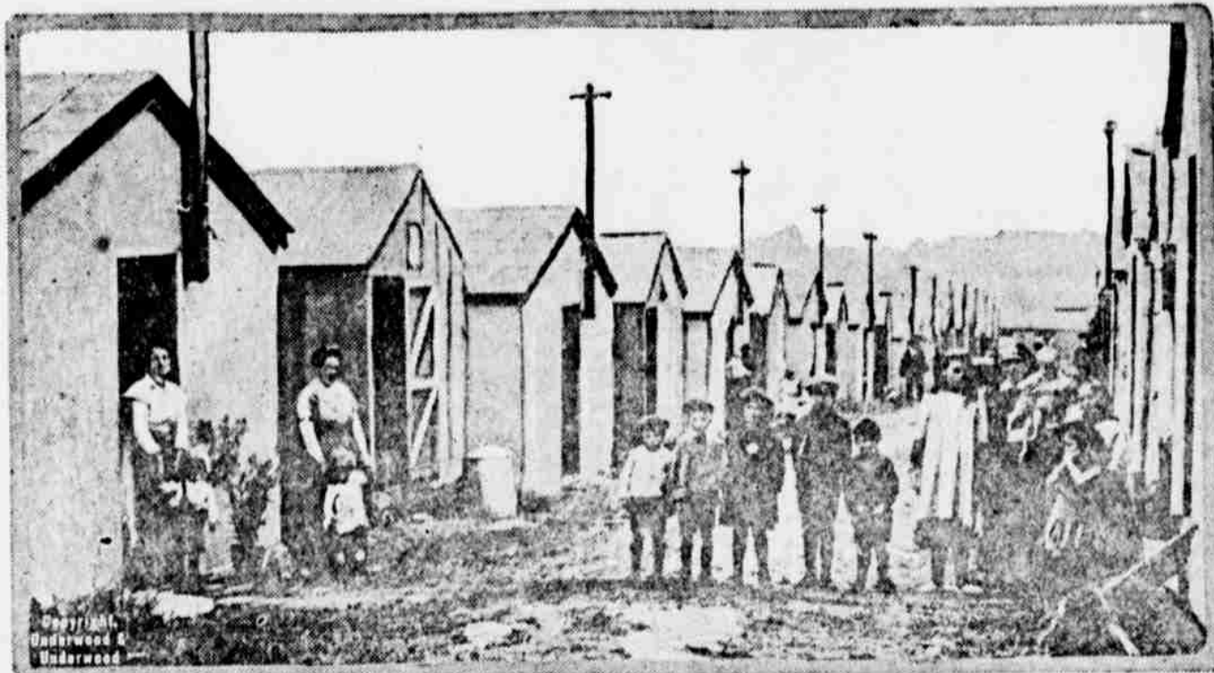
To defeat the housing shortage in England the government has allowed the city of Eastbourne to acquire these barracks, formerly known as the "cavalry camp," and the buildings have been converted into dwellings.