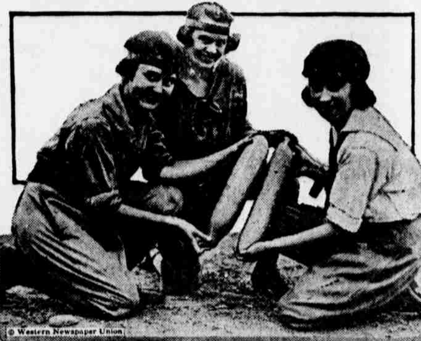
These three girls inspecting some cucumbers they have raised are members of the land army unit of the National League for Women's Service on the league's farm near Washington.