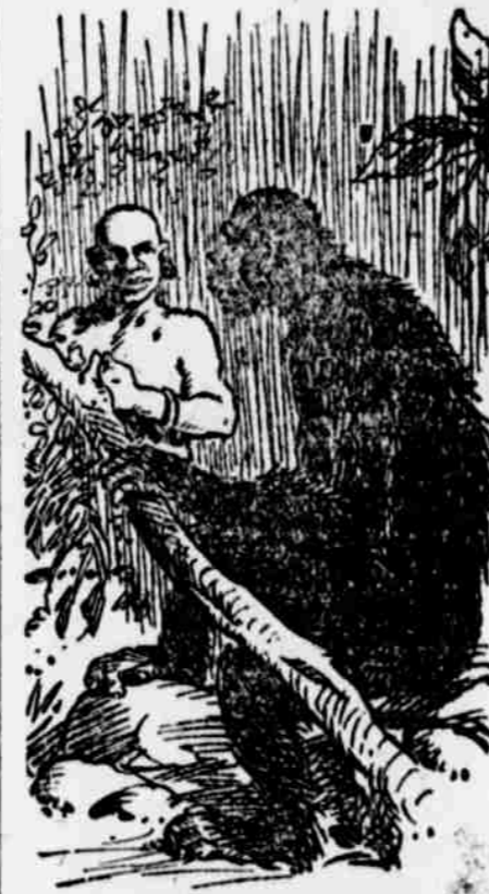
Could Talk to Natives.