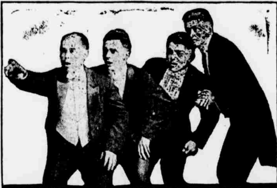
HEY! LOOK AT THAT!

Ask your local ticket agent to help you plan your trip and furnish you with descriptive booklets of points in which you are interested.