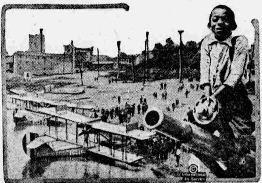
Three naval seaplanes moored on the shore of the Mississippi river at Memphis being viewed by a crowd of spectators. The planes are part of the fleet which includes submarines, sub chasers and destroyers, sent on a tour of the Mississippi river towns and cities to stimulate recruiting for the navy.