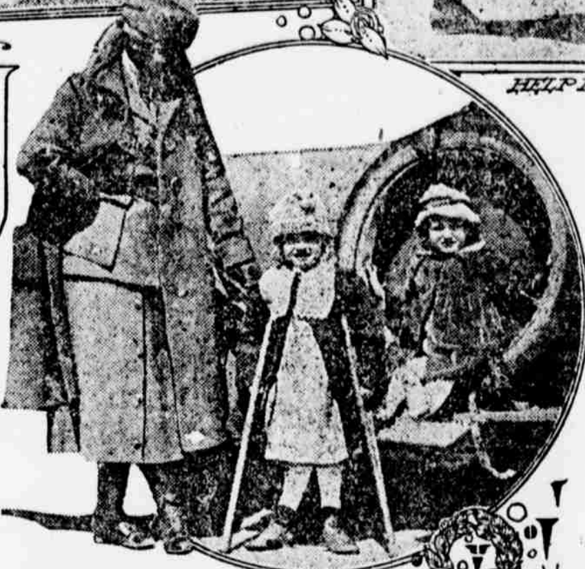
HELP FOR THE HELPLESS

The faith of the children accustomed to walk and run about is much shaken when they are