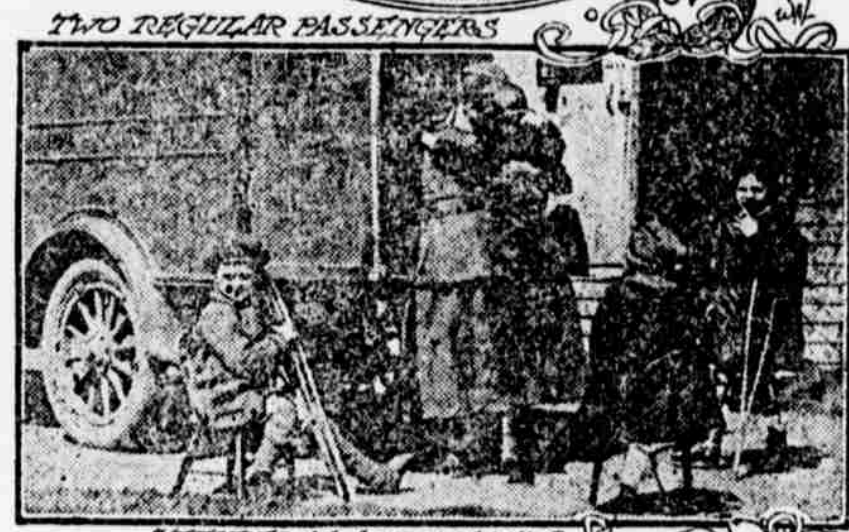
TWO REGULAR PASSENGERS