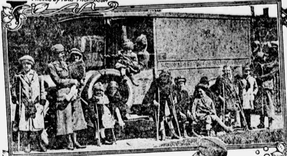
TRAVELING MADE EASY

Purpose: To provide organized trained women to meet social and economic needs.