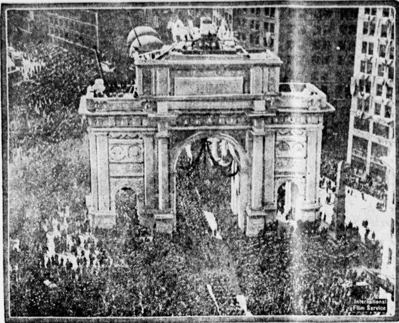
Scene in New York as the Twenty-seventh division was passing under the beautiful Victory arch during the parade of that famous fighting unit.