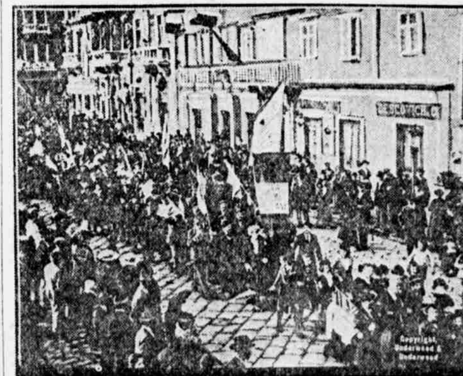
Demonstration of Italians in Fiume, the city on the Adriatic coast whose possession is in dispute between Italy and Jugoslavia.