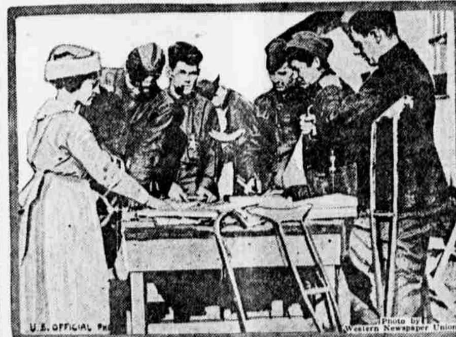
One of the most vital things in the reconstruction of the wounded and disabled soldier is to keep his mind occupied. This is done in France sometimes by teaching them how to make wooden dolls. The photograph shows a group of wounded at Savanny being instructed in this art.