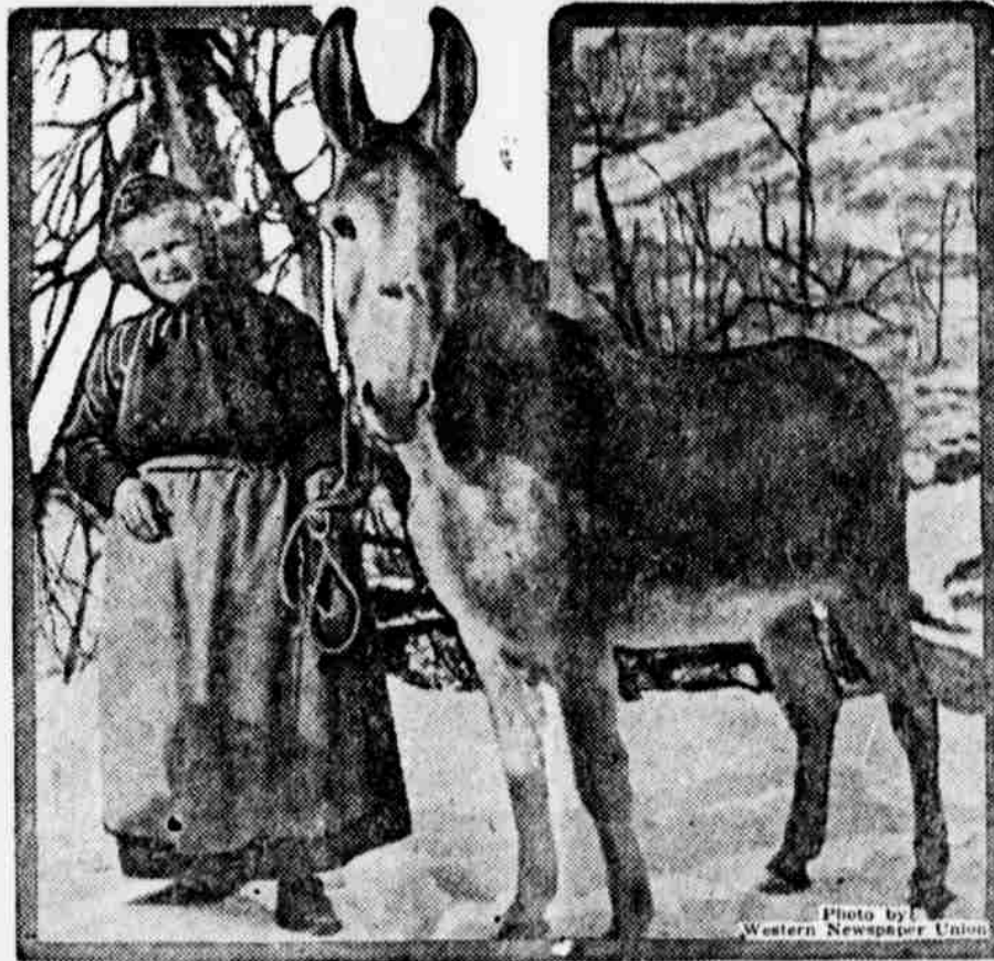
This donkey hauled the old lady to southern France when the Huns came into northern France, and has now hauled her back again to Cutry, her home town, where she lives in a cave with her donkey, the only companion she has left in the world.